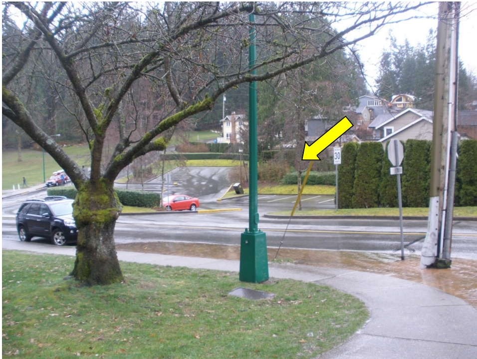
Picture (Parking) —Free overnight parking at this parking lot as well as on the street. Please watch for posted signs.