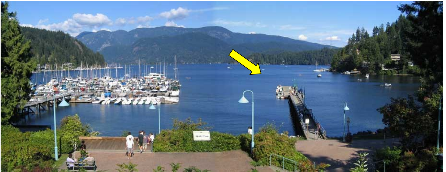
Picture (Gallant Wharf) —Dock in Deep Cove where our boats pick up / drop off guests.